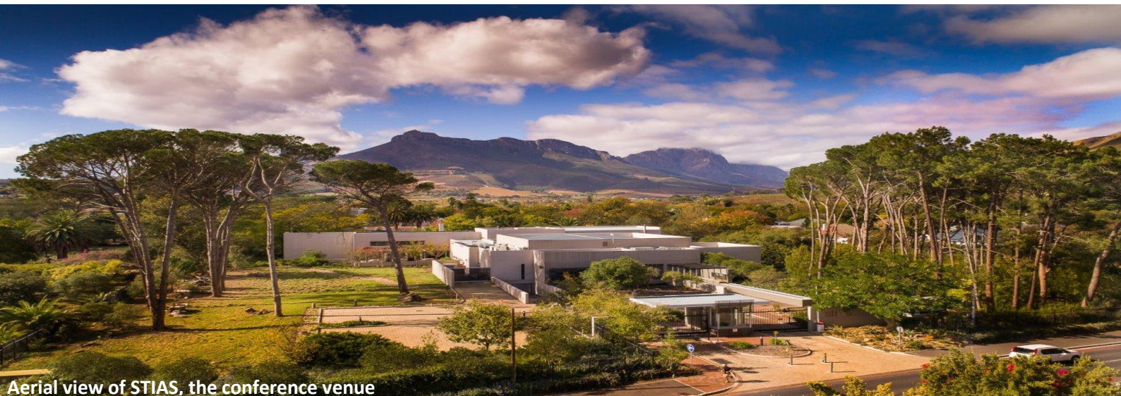
Aerial view of STIAS, the conference venue